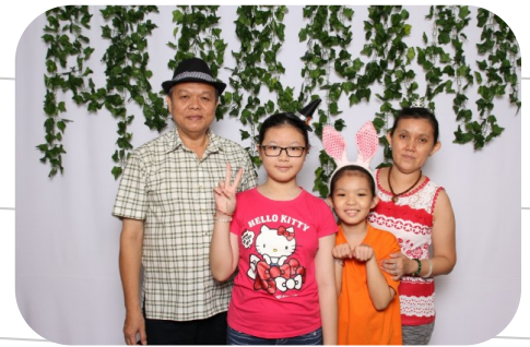
Family Events 家庭活动