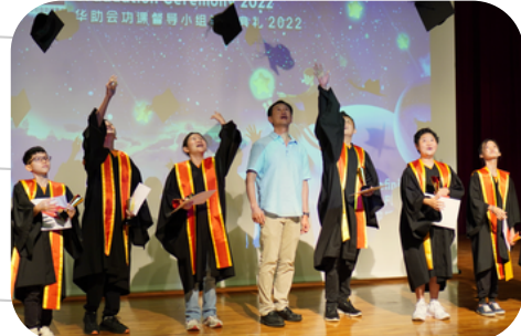
Graduation Ceremony 毕业典礼