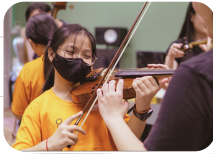
Enrichment Activities 益智活动