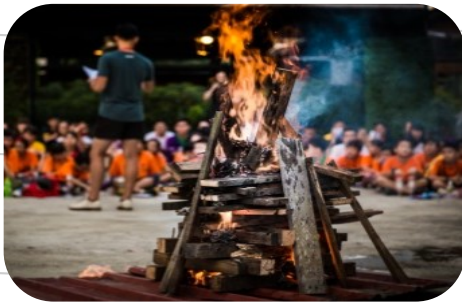
June Camp 六月假日营