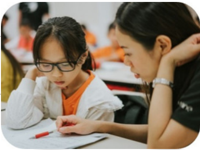
Homework Supervision 功课督导

✦ Programme is fully subsidised by CDAC ✦ 华助会提供全额津贴