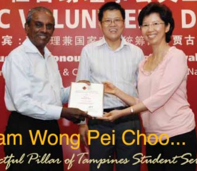
Elaine Kok Mei Yu & Kok Siew Huan

Deputy Prime Minister & Minister for National Security