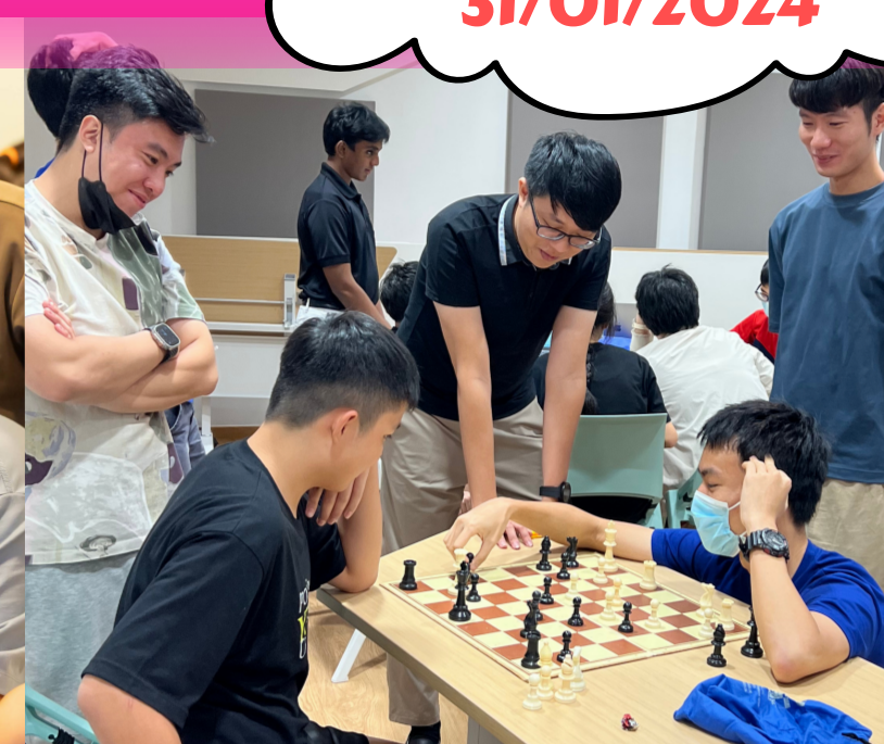
Fun & Games